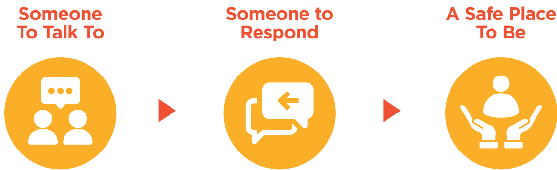
Figure 1: SAMHSA Best Practice Approach to Youth Crisis Services

Connecticut has established four interrelated services that operate as a system to address these needs; one service cannot function properly without the other three.